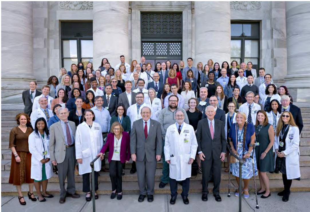
Department of Psychiatry Faculty and Trainees