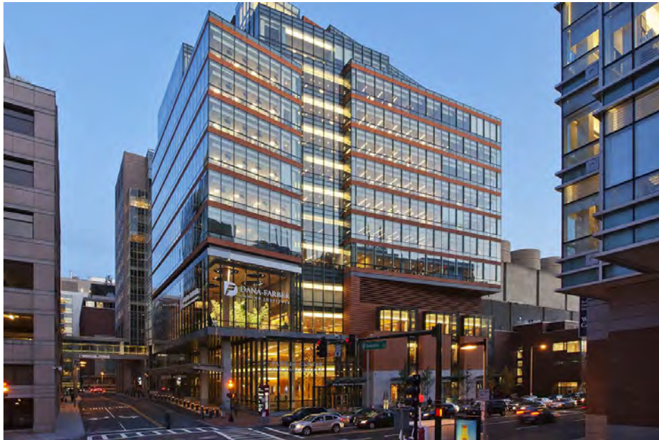
Dana Farber Cancer Institute

music performances, and pet therapy. New additions to our programming include multiple peer-recovery services by a certified peer specialist employee. The unit was renovated in 2017 to expand the number of single occupancy beds, add an outdoor terrace and provide aesthetic updates throughout.