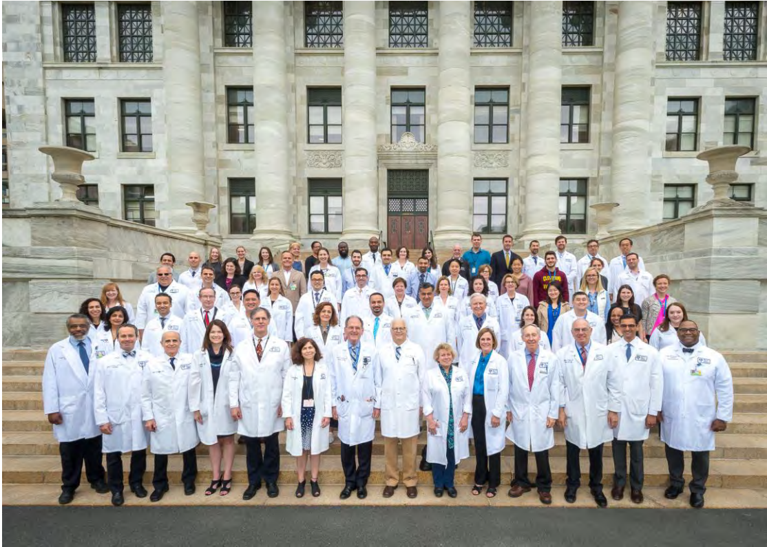
Department of Neurology Faculty and Trainees