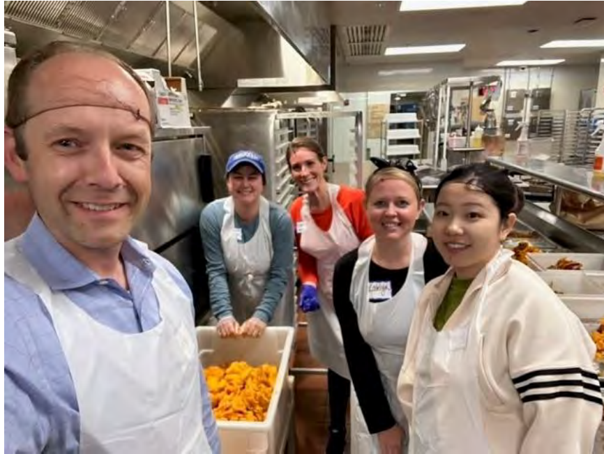
Social Justice Engagement at Community Servings, Jamaica Plain