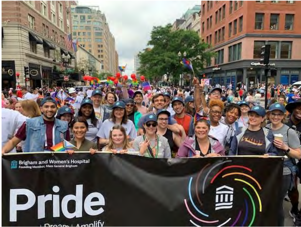
Boston Pride for the People Parade – Brigham and Women's Hospital