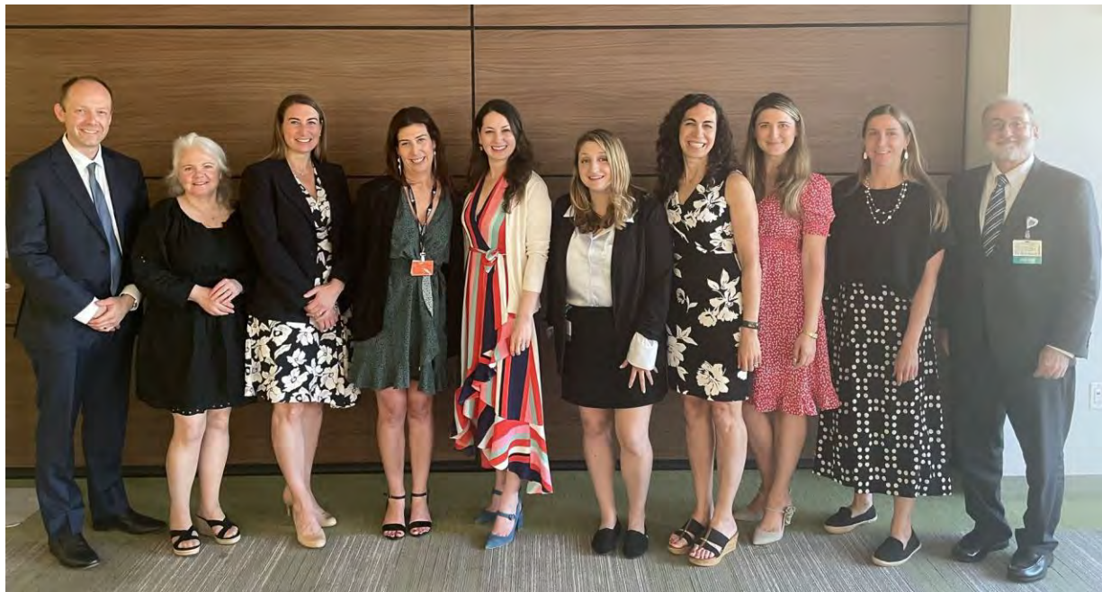
BWH/BWFH Psychology Training Graduation