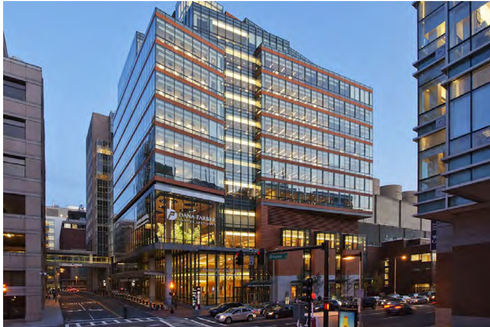
Dana Farber Cancer Institute

music performances, and pet therapy. New additions to our programming include multiple peer-recovery services by a certified peer specialist employee. The unit was renovated in 2017 to expand the number of single occupancy beds, add an outdoor terrace and provide aesthetic updates throughout.