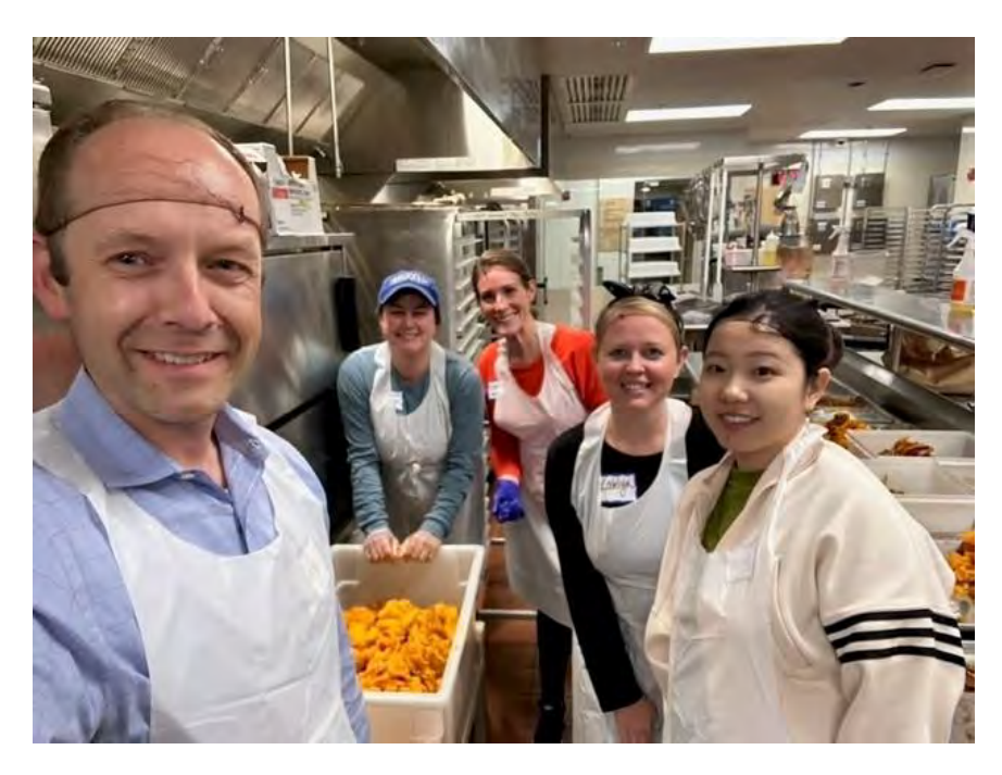
Social Justice Engagement at Community Servings, Jamaica Plain