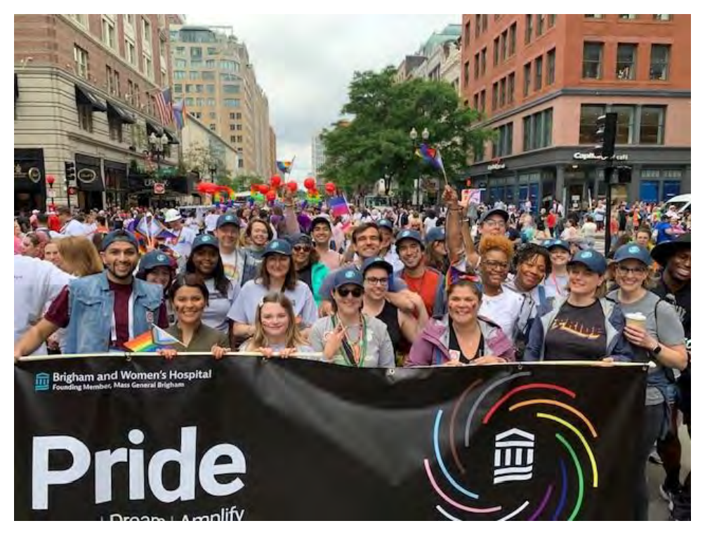
Boston Pride for the People Parade – Brigham and Women's Hospital