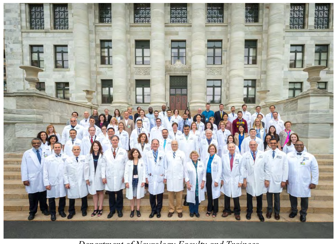
Department of Neurology Faculty and Trainees