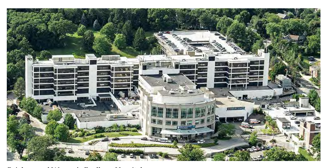
Brigham and Women's Faulkner Hospital

neurology. The CBMM fosters a multidisciplinary approach to clinical care and research and is comprised of a team of specialists in behavioral neurology, neuropsychiatry, geriatric psychiatry, neuropsychology, and social work. The population of patients served at the CBMM includes adults who present with cognitive, emotional, or behavioral difficulties secondary due to disease, injury, or developmental disorders of the central nervous system. These conditions include mild cognitive impairment, neurodegenerative conditions, epilepsy, stroke, brain tumors, cancer, multiple sclerosis, traumatic brain injury, neurobehavioral, primary psychiatric syndromes, and neurodevelopmental syndromes. The training opportunities at the CBMM include neuropsychological assessment and group cognitive rehabilitation interventions.