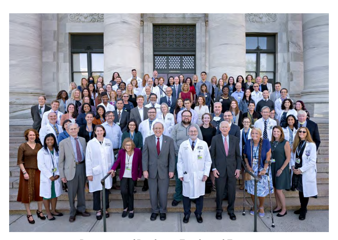
Department of Psychiatry Faculty and Trainees