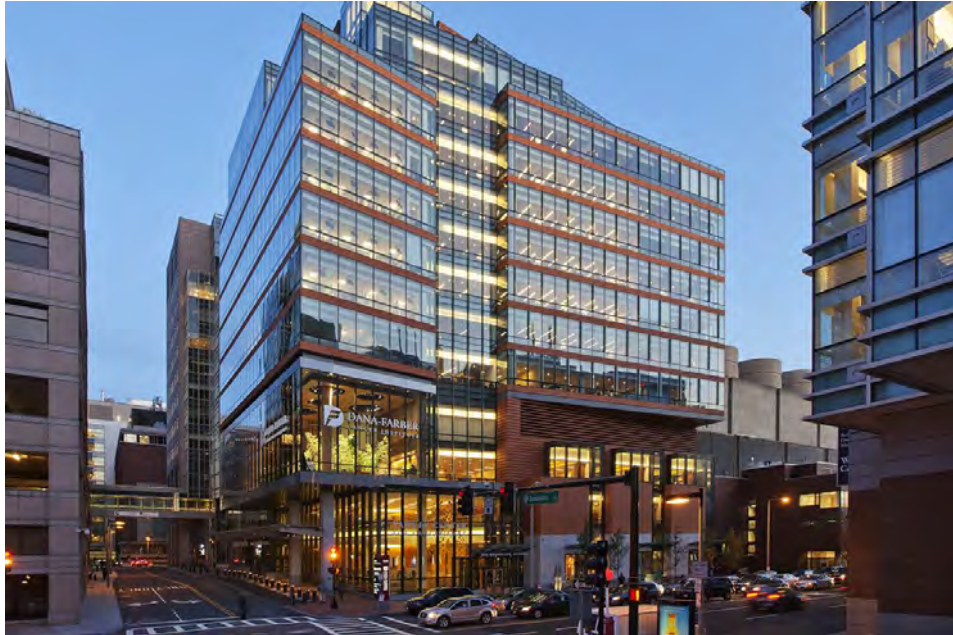
Dana Farber Cancer Institute

music performances, and pet therapy. New additions to our programming include multiple peer-recovery services by a certified peer specialist employee. The unit was renovated in 2017 to expand the number of single occupancy beds, add an outdoor terrace and provide aesthetic updates throughout.