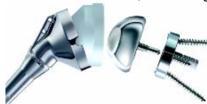
Figure 1. Reverse Total Shoulder Arthroplasty Components. The prosthesis has 5 parts: the glenoid base, the glenosphere, a polyethylene cup, humeral neck, and the humeral stem.

The rTSA changes the orientation of the shoulder joint by replacing the glenoid fossa with an artificial glenoid base plate and glenosphere; and the humeral head with a shaft and concave cup that both lateralizes and distalizes the humeral shaft (refer to Figure 1).