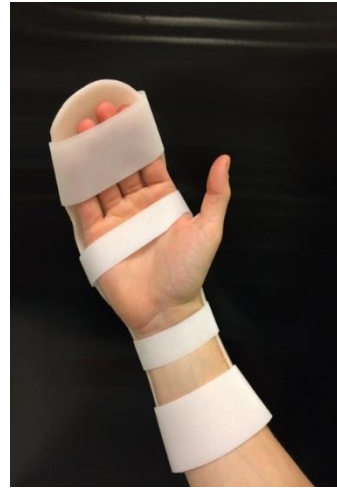
EAM: Week 1 to 2 touching IF or 25%