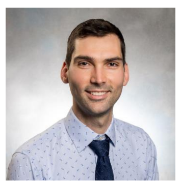
PGY-1 Residency Program Coordinator