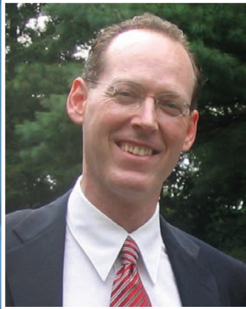
CHIEF> PAUL FARMER, M.D., PH.D. (2003–2005, 2009–PRESENT)