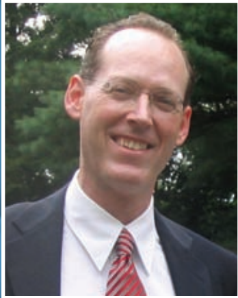
CHIEF> PAUL FARMER, M.D., PH.D. (2003–2005, 2009–PRESENT)