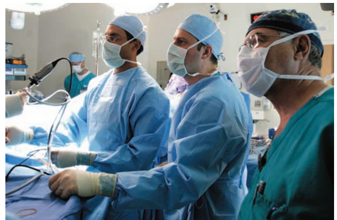
Neurosurgeons and neuroendocrinologists collaborate with many other subspecialists in the Pituitary and Neuroendocrine Program to deliver advanced multidisciplinary care for patients.

Patients are initially evaluated by both a neuroendocrinologist and a neurosurgeon in the Program during one visit, and additional specialists participate in each patient's care as indicated. A full range of diagnostic testing is available to assess pituitary function, including advanced dynamic endocrine testing and inferior petrosal sinus sampling when