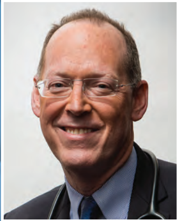
CHIEF> PAUL FARMER, M.D., PH.D. (2003–2005, 2009–PRESENT)